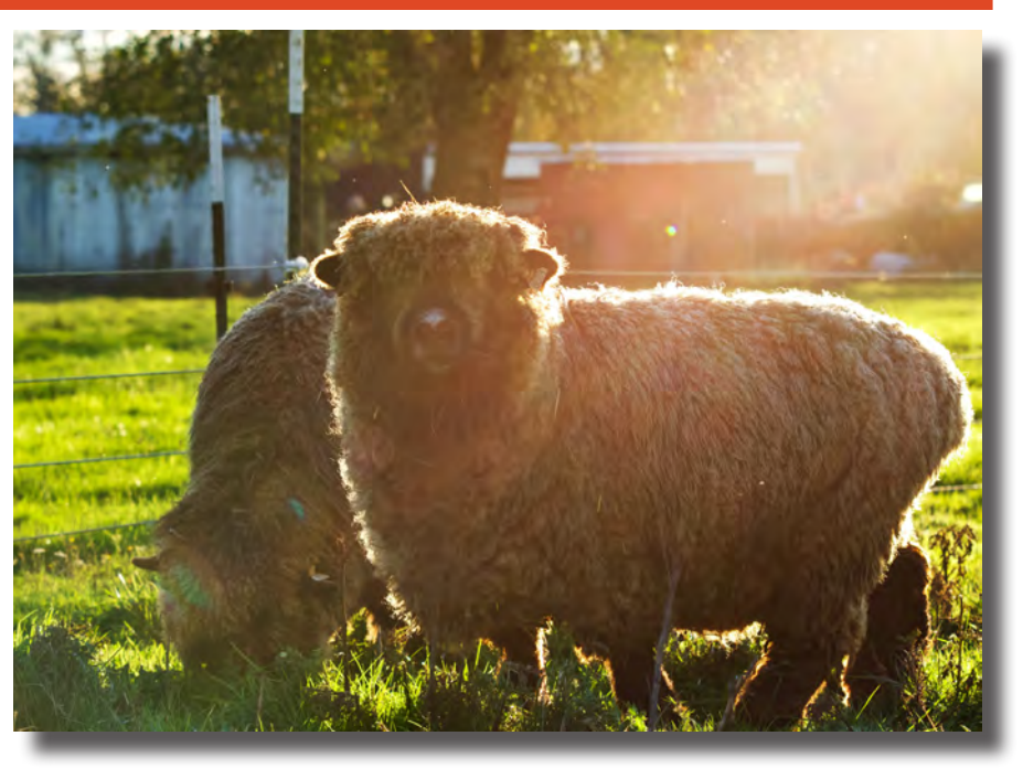
Romeny sheep enjoying the Fall sur

When animals do not have the adequate nutrition, environment, and medicine they need, there can be fatal consequences. Key places to start in your research process should include: