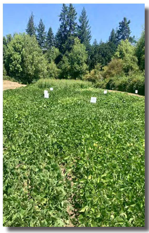
Sights found at the Organic Grains and Pulses Field Day