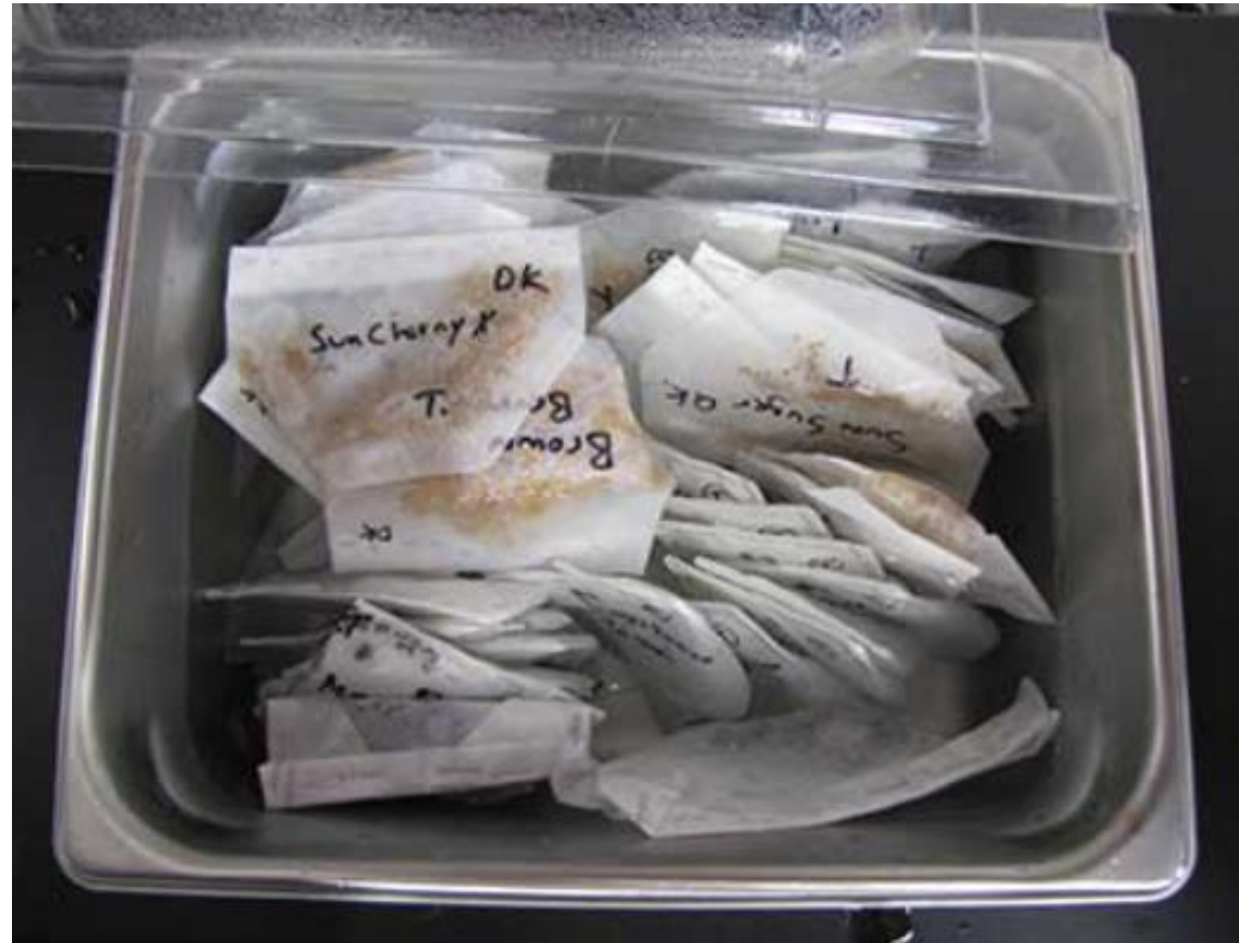
Stapled coffee filters

From: http://vegetablemndonline.ppath.cornell.edu/NewsArticles/HotWaterSeedTreatment.html