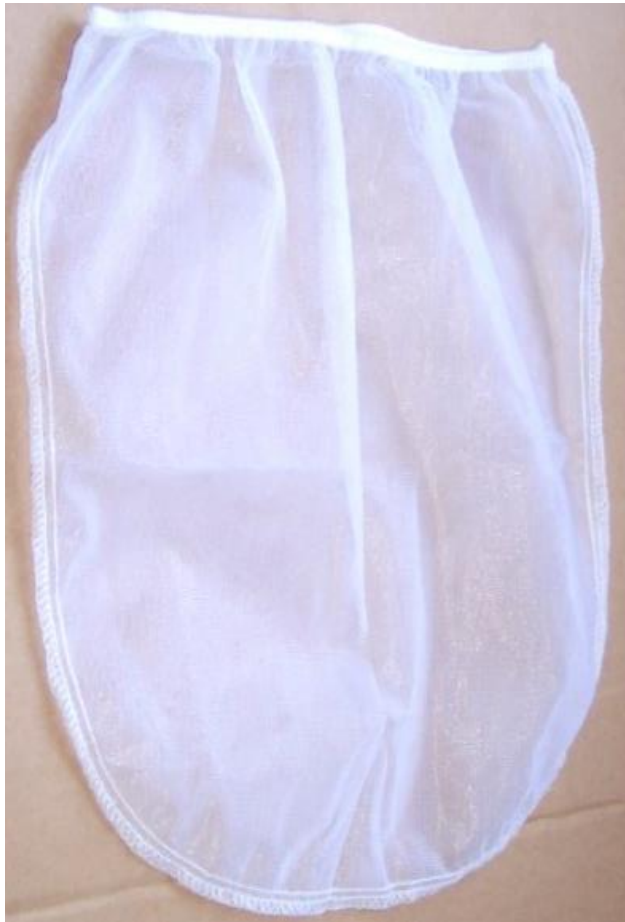
1 gallon paint strainers with rubber bands to tie the top