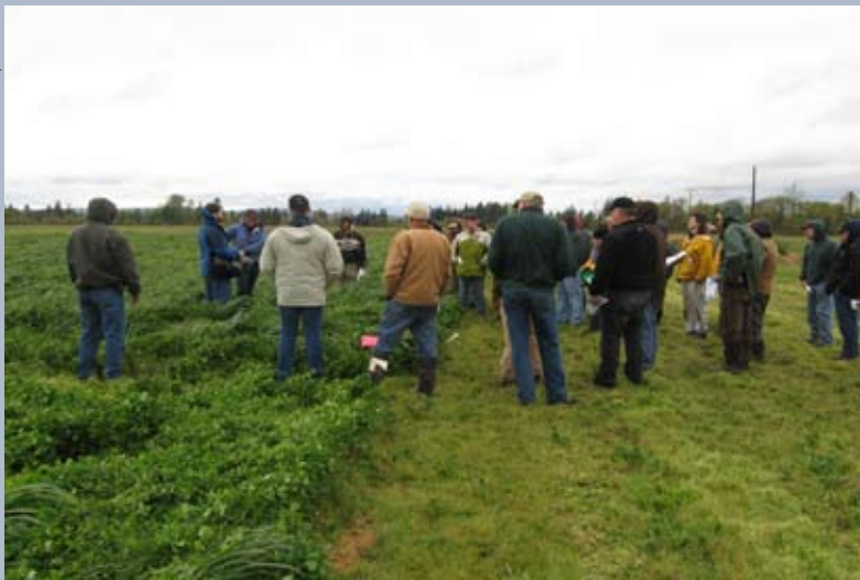
Nick Andrews and Kristin Pool discuss cover crop research with growers at David Brown’s Mustard Seed Farms this April.

Nearly all contemporary vegetable varieties were selected in conventional systems and may not be adapted to organic conditions, and popular heirloom varieties may lack productivity. This project grew out of an earlier OSU organic potato research project