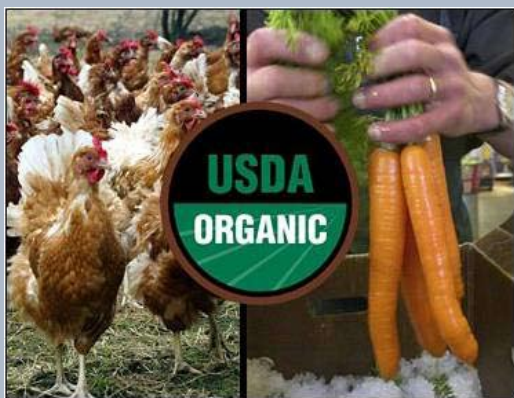
USDA sets the guidelines for the organic label which comes in two flavors; 100% Organic and Organic.

the grocery's distributor, third-party transportation company, and finally the grower in Chile.