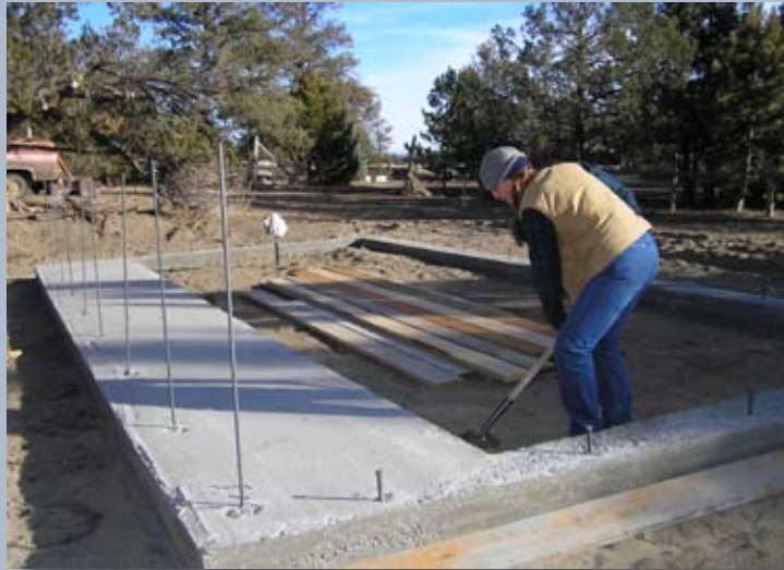
Rainshadow Organics farm will soon have a four-seasons greenhouse to help expand the growing opportunities in Central Oregon.

“A recurring theme at the conference was the need to form a cooperative where local producers can pool their resources to meet local demands and share knowledge,” she says. “Through a local cooperative, those of us with small farms could possibly work together to purchase equipment and supplies and figure