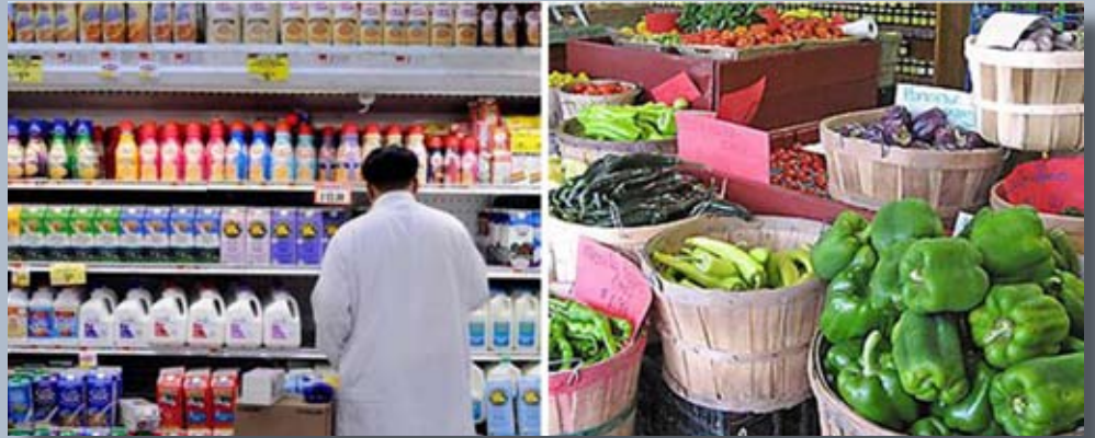
Labeled versus unlabelled: Labeling aids consumers make decisions on how to spend their food dollar

Natural: product does not contain artificial flavor,